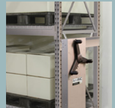
STORAGE CONFIGURATIONS Accommodates various pallet racking and shelving.