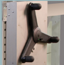
MECHANICAL ASSIST OPERATION with three-spoked handle with rotating hand knobs for ease of use.