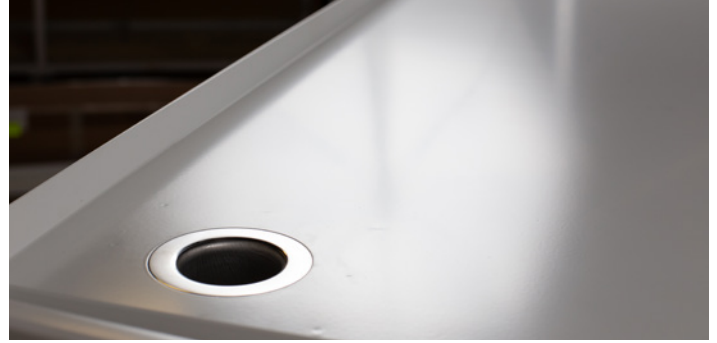
Sized to fit standard tables; custom sizes available