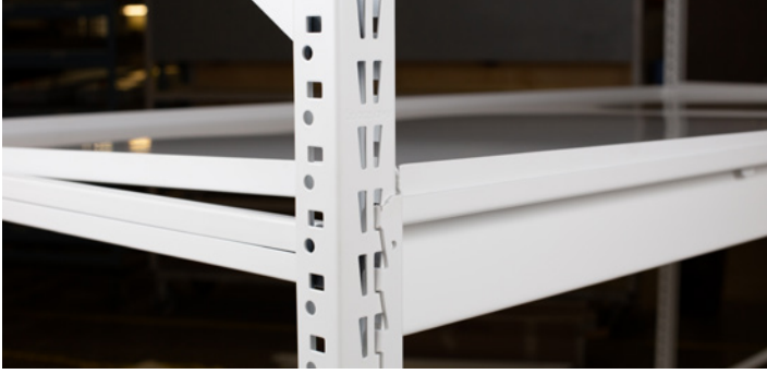
Tray angle can be adjusted by moving beams