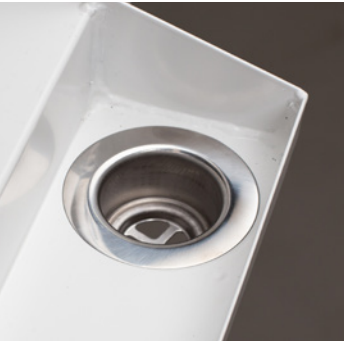
Drains integrate with existing plumbing